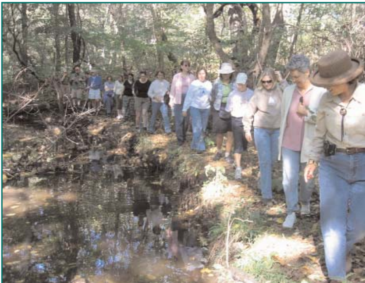
Open Space Ramblers along Thorntown Creek in October