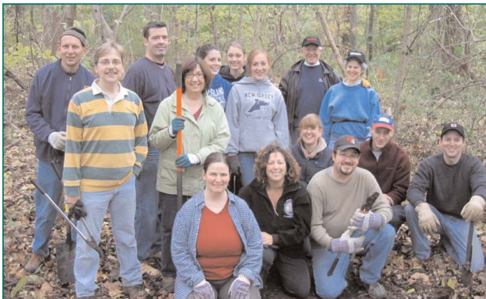
Volunteers created a trail along Thorntown Creek in November