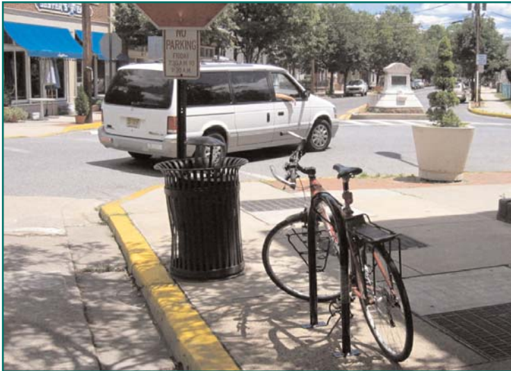
New bicycle parking rack at corner of Walnut and Farnsworth