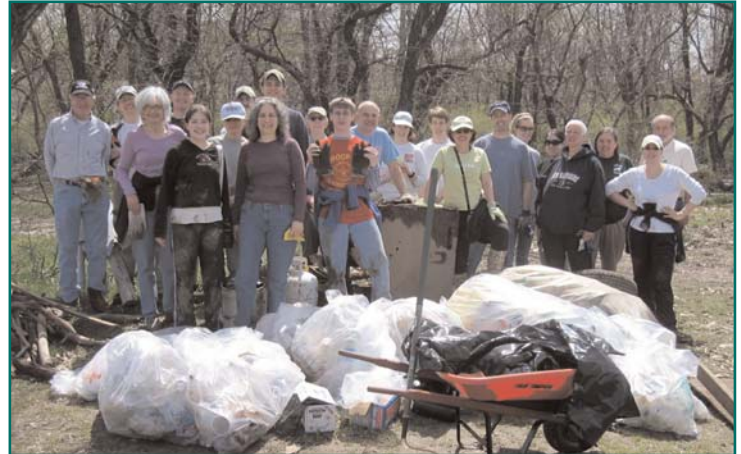
Volunteers cleaned up Bordentown Beach and the RiverLINE parking lot on Earth Day