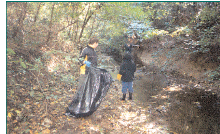
Members of Scout Troop #13 clean up Thorntown Creek