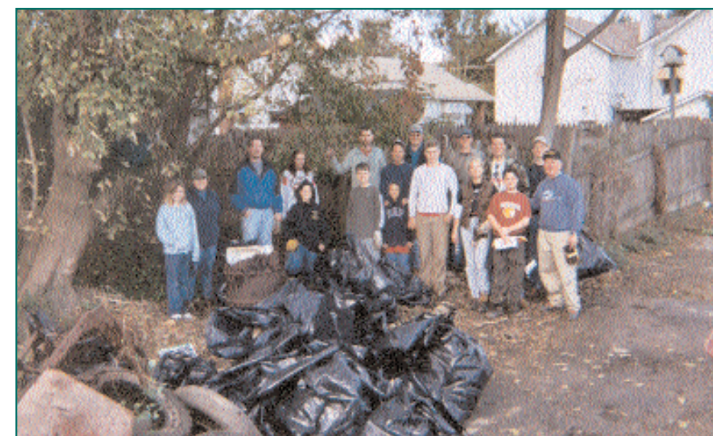
Volunteers after Cleanup of Thorntown Creek