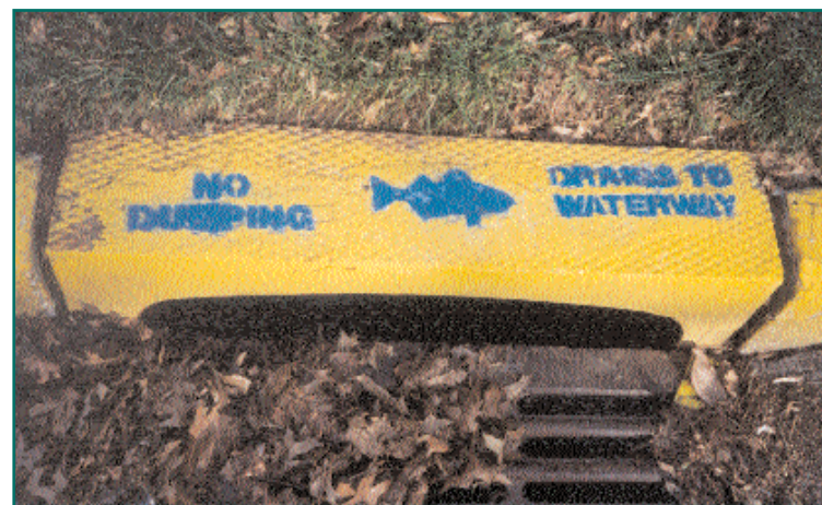
"No Dumping, Drains to Waterway" Storm Drain Stencil

on the River Line. Participated in creation of a safety video, with Bcec member portraying a commuter bicyclist.