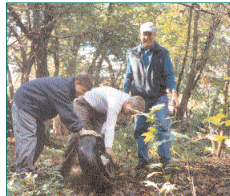
Removing tires from Thorntown Creek floodplain