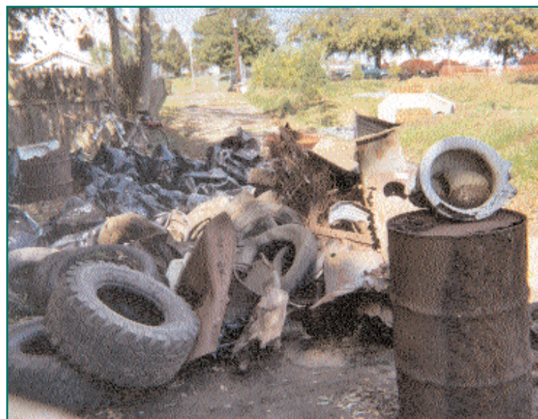
Trash removed from Thorntown Creek

regarding land use and transportation planning for non-motorized transit as well as NJDOT Office of Bicycle & Pedestrian Program planning and technical assistance.