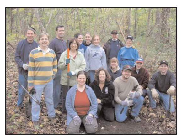
Volunteers created the first section of the Thorntown Creek Greenway Trail in November

October was an exciting month for the Thorntown Creek Greenway projects. Several dozen volunteers wielding shovels and clippers christened the first nature trail in Bordentown City in October, creating a 4 foot wide path along a 1/8 mile section of Thorntown Creek. Invasive multiflora rose was removed, fallen logs were moved aside, and a sinuous path along the creek emerged at the end of the morning's work.